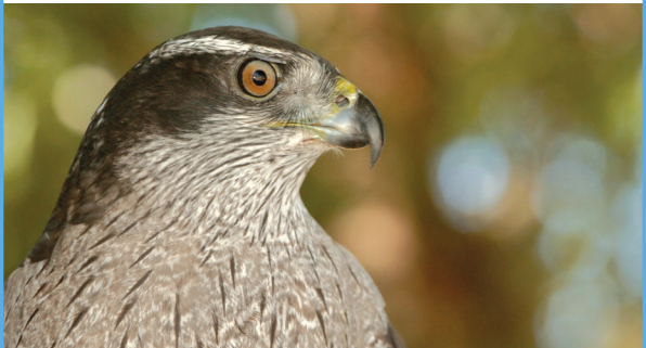
Northern Goshawk ( Accipiter gentilis )

FROM MOTHER ROAD: 9.2 miles southwest of Flagstaff on Woody Mountain Road / Forest Service Road 231 BEST SEASON: Year-round, summer for amphibians; caution should be used in wet conditions; high-clearance or 4X4 vehicle recommended WILDLIFE TO WATCH: Prairie dogs, coyote, grey fox, pronghorn, elk, mule deer, cinnamon teal, mallards, garter snakes, and northern leopard frogs