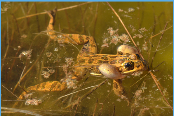
Northern Leopard Frog ( Lithobates pipiens )

FROM MOTHER ROAD: 9.2 miles southwest of Flagstaff on Woody Mountain Road / Forest Service Road 231 BEST SEASON: Year-round, summer for amphibians; caution should be used in wet conditions; high-clearance or 4X4 vehicle recommended WILDLIFE TO WATCH: Prairie dogs, coyote, grey fox, pronghorn, elk, mule deer, cinnamon teal, mallards, garter snakes, and northern leopard frogs