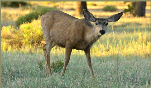
Mule Deer (Doe) ( Odocoileus hemionus )

FROM MOTHER ROAD: 1 mile; 560 N Thorpe Rd; pond is a short walk east of the Thorpe Park ball fields parking lot BEST SEASON: Winter for migratory birds, summer for songbirds WILDLIFE TO WATCH: northern shoveler, mallards, green-winged teal, great blue heron, osprey, red-winged blackbird, mountain chickadee, Cassin's vireo, ash-throated flycatcher, western bluebird, house sparrow, rainbow trout, catfish