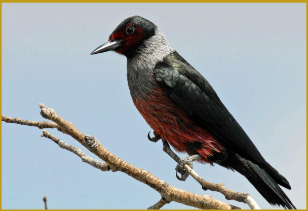
Lewis's Woodpecker ( Melanerpes lewis )

FROM MOTHER ROAD 0.8 miles; 245 N Thorpe Road; trailhead starts behind parking lot BEST SEASON: Late summer to fall WILDLIFE TO WATCH: Grey fox, porcupines, bats, elk, mule deer, pronghorn, northern goshawks, bald eagles and others