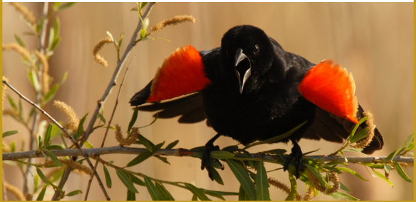
Red-winged Blackbird ( Agelaius phoeniceus )

FROM MOTHER ROAD : 11.4 miles east of Flagstaff; 3920 N El Paso Road BEST SEASON: Year-round; parking may be muddy in wet conditions WILDLIFE TO WATCH: Lewis's woodpecker among other birds and raptors, foxes, bats, mule deer, elk, multiple species of lizard, butterflies