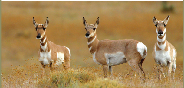
Pronghorn Antelope ( Antilocapra americana )

FROM MOTHER ROAD: 2.4 miles; 2400 N Gemini Road BEST SEASON: Late summer to fall WILDLIFE TO WATCH: mule deer and lark sparrows, among other birds